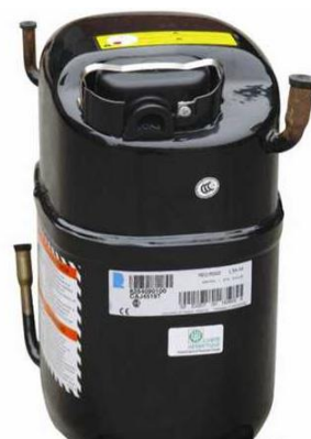
France Tecumseh compressor